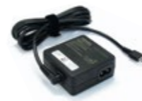
Additional dynabook Universal USB Type C™ PD AC Adaptor (PA5352E-1AC3)