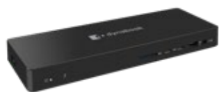
Dynaook Thunderbolt™ 4 Dock (PS0120LA1PRP)