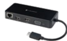
Dynabook USB-C™ to HDMI® / VGA / LAN / USB 3.0 Travel Adapter with Power Delivery (PD) Charging (PS0001UA1PRP)